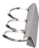
DS-1275ZJ Vertical pole mount