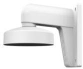
DS-1272ZJ-110-TRS Wall Mounting Bracket