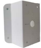
DS-1276ZJ Corner Mounting Bracket