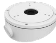
DS-1281ZJ-S Inclined Base Mounting Bracket